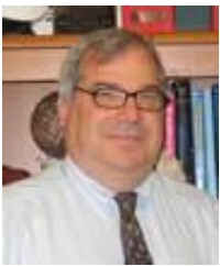
Dr. Daniel Lackland

The first quarter has started with great progress for global hypertension control with great efforts and achievements from our partners and regional offices. These activities include strategies for population hypertension control and prevention, and most important – the increase in high blood pressure awareness on a global scale.