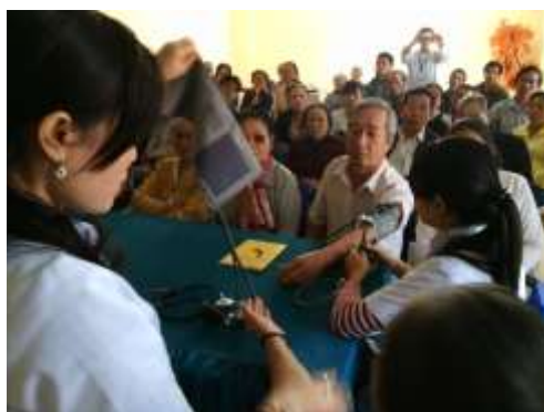
WHD Efforts in Vietnam Participated in Educational Activities