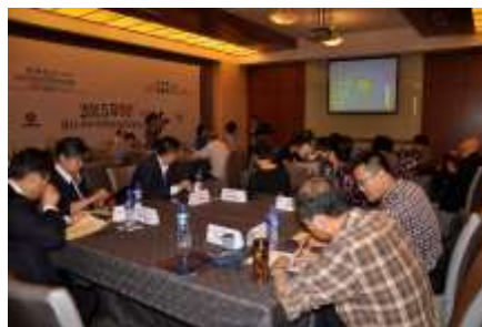
WHD Efforts in China Total Screened: 900,458 People