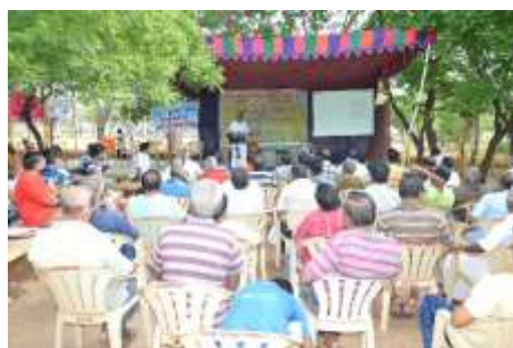
WHD Efforts in India Total Screened: 4,655 People