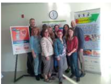
WHD Efforts in Canada Total Screened: 627,842 People