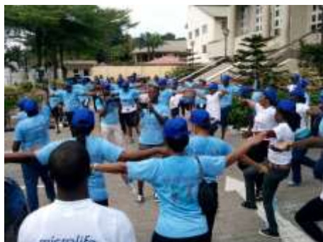
WHD Efforts in Nigeria Participated in Educational Activities