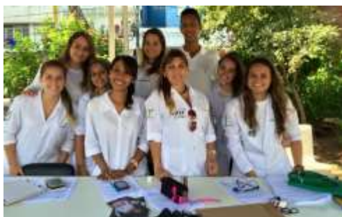
WHD Efforts in Brazil Total Screened: 204 People