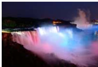
WHD Efforts in The United States also Total Screened: 217,360 People Also as a joint effort ASH and Hypertension Canada lit Niagara Falls Red and Blue (Pic-tured) for Hypertension Awareness

The World Hypertension League thanks all those who participated in screening and educating the people across the world! It is due to the great efforts of our members that World Hypertension Day 2015 was a success!