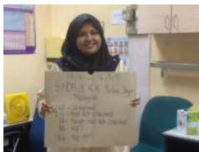
WHD Efforts in Malaysia Total Screened: 240 People