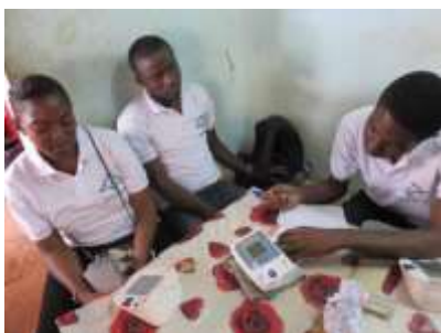
WHD Efforts in Cameroon Total Screened: 1,085 People