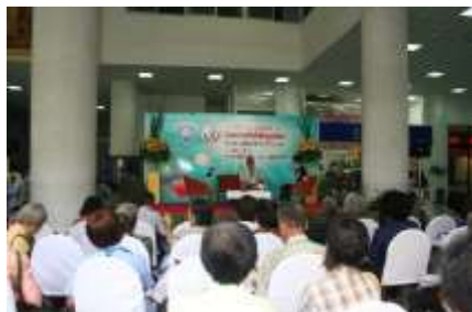
WHD Efforts in Thailand Total Screened: 323 People