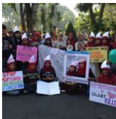
WHD Efforts in Indonesia Participated in Educational Activities