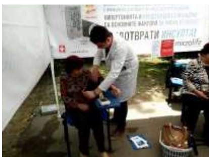
WHD Efforts in Bulgaria Total Screened: 1,805 People