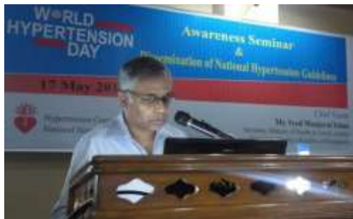
WHD Efforts in Bangladesh Participated in Educational Activities